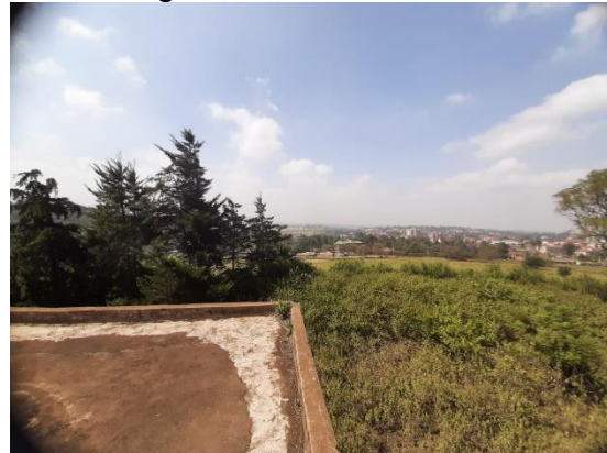
Side facing Kibiko – Suswa Road