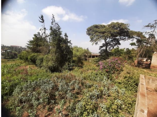
Rear side of the property