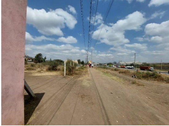
Front of the property