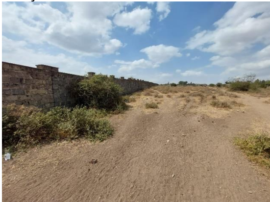
Entry to the Land