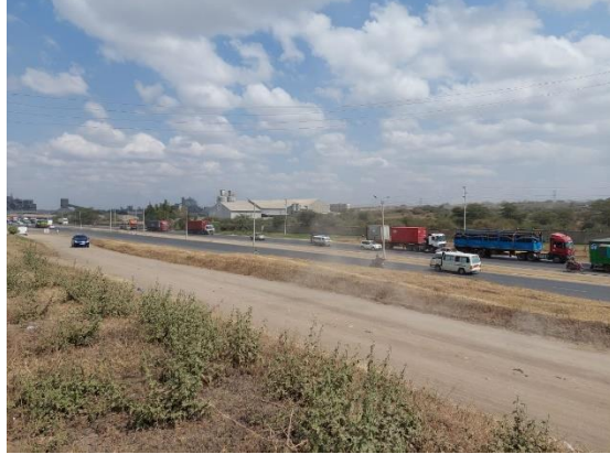
View of Mombasa Road